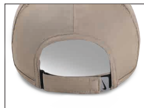
Hook &amp; Loop