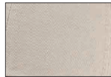
Washed Cotton Twill